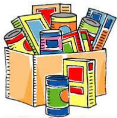
Feeding the Community

Please save Campbell soup and Box Top labels; the schools get 10 cents for each label. Just give your labels to Carol Moser.