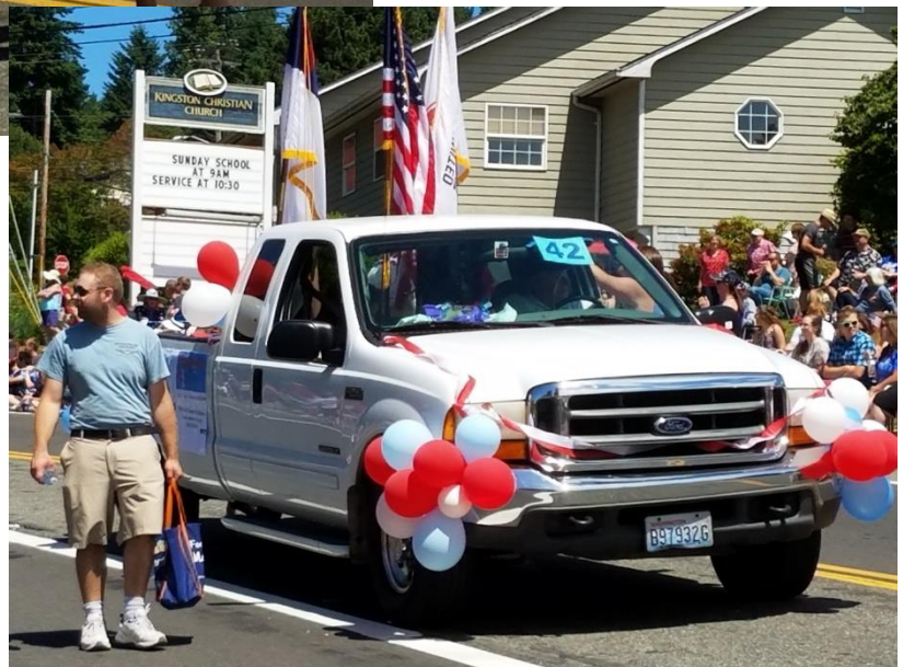
Team Redeemer sating our neighbors thrust as part of the Kingston Fourth of July Parade